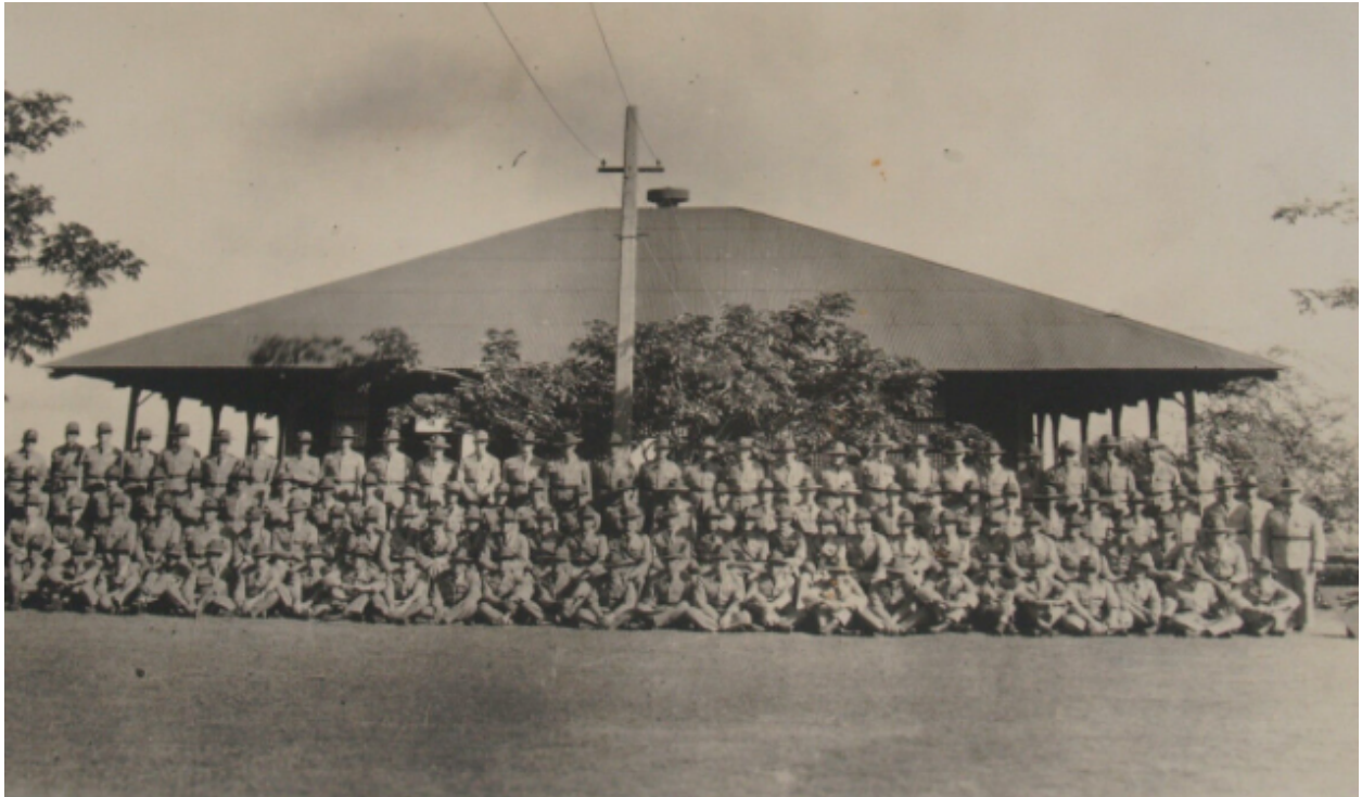
3 Pursuit Squadron, 1930